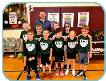
Youth Basketball League