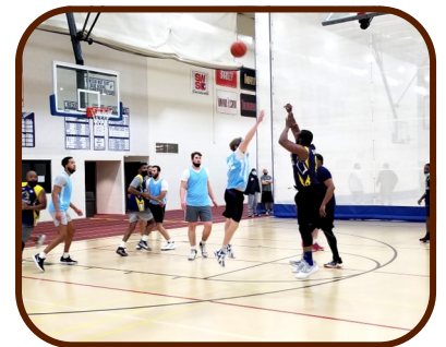
Mens Basketball League