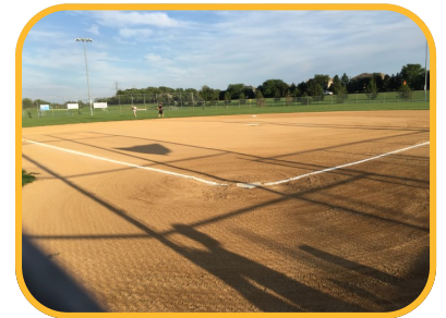
Commissioners Park Softball Field