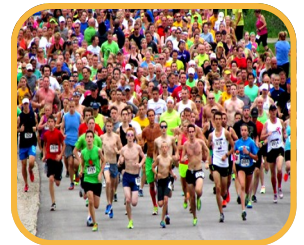
Short Run on a Long Day