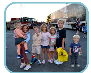
Back To School Bash