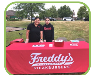
Parties in the Park