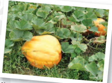
Giant Pumpkins grown at the Community Garden plots at Commissioners Park.

During the past four months, Buildings and Grounds staff continue to ensure the parks and buildings are safe and enjoyable for residents. District staff have worked to prune trees at 17 park locations and conducted playground inspections. Staff are working to improve the park site amenities, which includes repairing and cleaning the picnic tables throughout the parks. New stone, funded by Operation Playground Foundation, was added to the Bark Park which reduces the mud that the dogs come in contact with. The Park District continues to invest monies to maintain the District buildings. A partial roof replacement was completed at the Founders Community Center and the heating and air conditioning at the Puent building have been replaced with energy efficient units. This spring will be the second year for the Community Garden plots at Commissioners Park. The inaugural year was quite a success as the plots yielded great crops. Staff are adjusting the layout to allow gardeners easier access to their plots. See page 39 for additional Community Garden Plot program details.