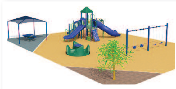
Site rendering of the Stone Creek Park Playground.